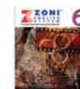
Zoni English System 6