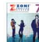
Zoni English System 7