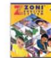
Zoni English System 1

The Zoni English System has been designed as a classroom instructional method in response to the demonstrated great needs of nonnative speakers of English in everyday life in English-speaking countries.