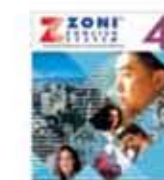
Zoni English System 4