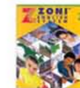
Zoni English System 2