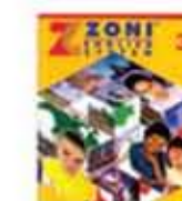
Zoni English System 3