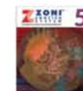
Zoni English System 5